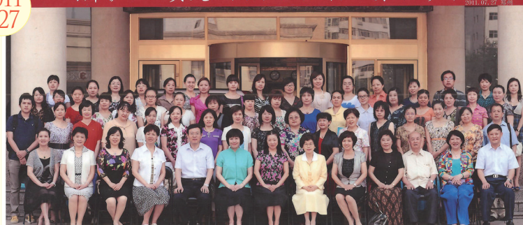
本基金會與河南護理學會在鄭州市舉辦「兩岸愛滋病防治護理學術交流」全體學員合影 NAPF held an academic exchange seminar in Zhengzhou (Henan Province), China.