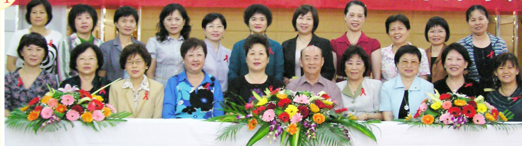
組團赴福建省參加科學技術協會第九屆 學術年會暨首屆海峽護理論壇 NAPF attended the academic convention and Cross-Strait Nursing Conference in Fujian, China.