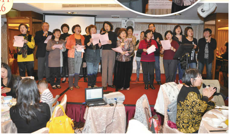
本基金會舉辦感恩餐會，以感謝各界的支持 NAPF hosted an appreciation dinner in honor of the support from contributors.