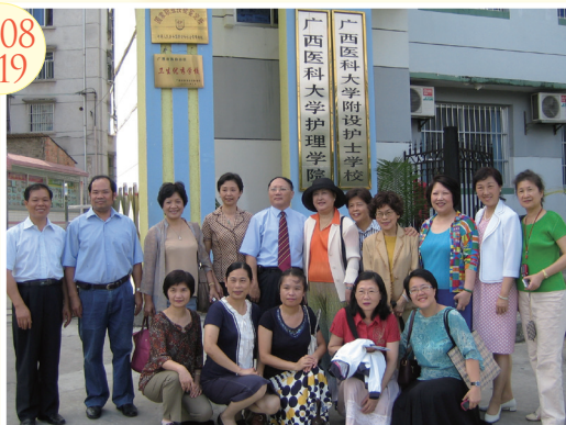
組團赴廣西參訪廣西醫科大學護理學院 NAPF visited the Nursing College & Nursing School of Guangxi Medical University.